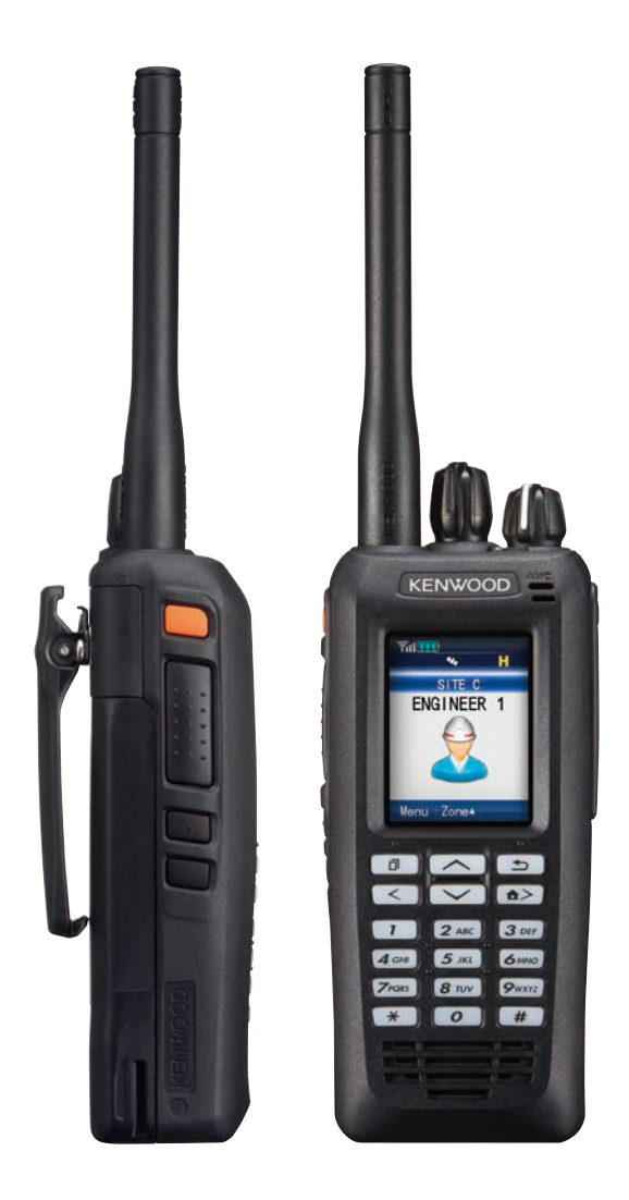
TK-D200(G)/D300(G) Display model