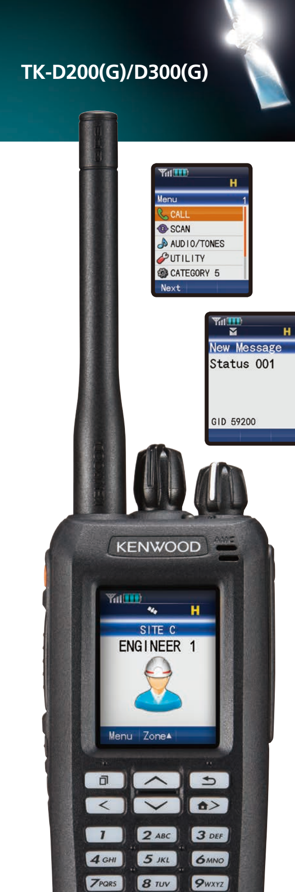
\begin{array}{c} \text{Actual size} \\ \text{TK-D200(G)/D300(G)} \end{array}